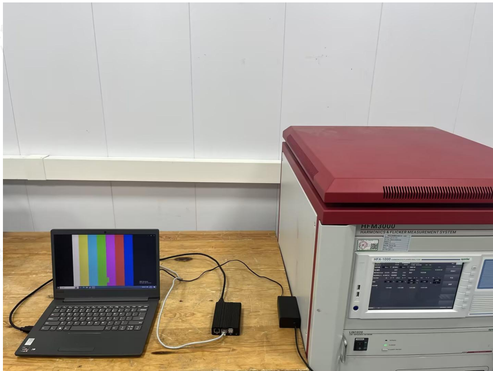
Voltage Fluctuations and Flicker