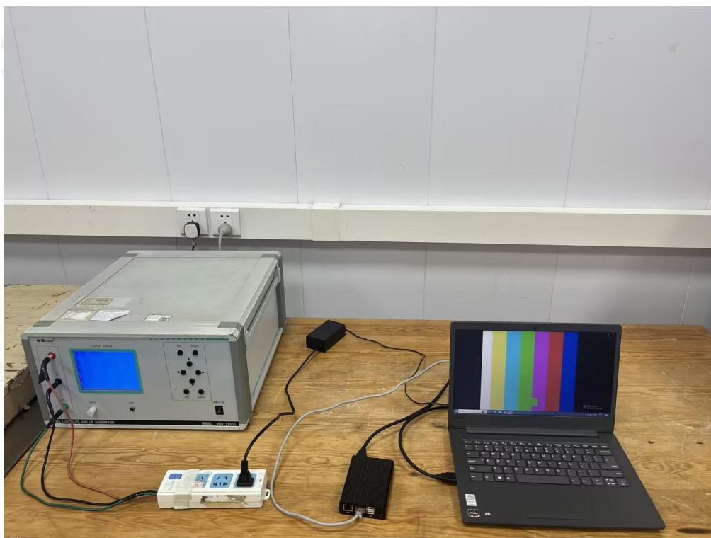
Voltage Dips and Interruptions