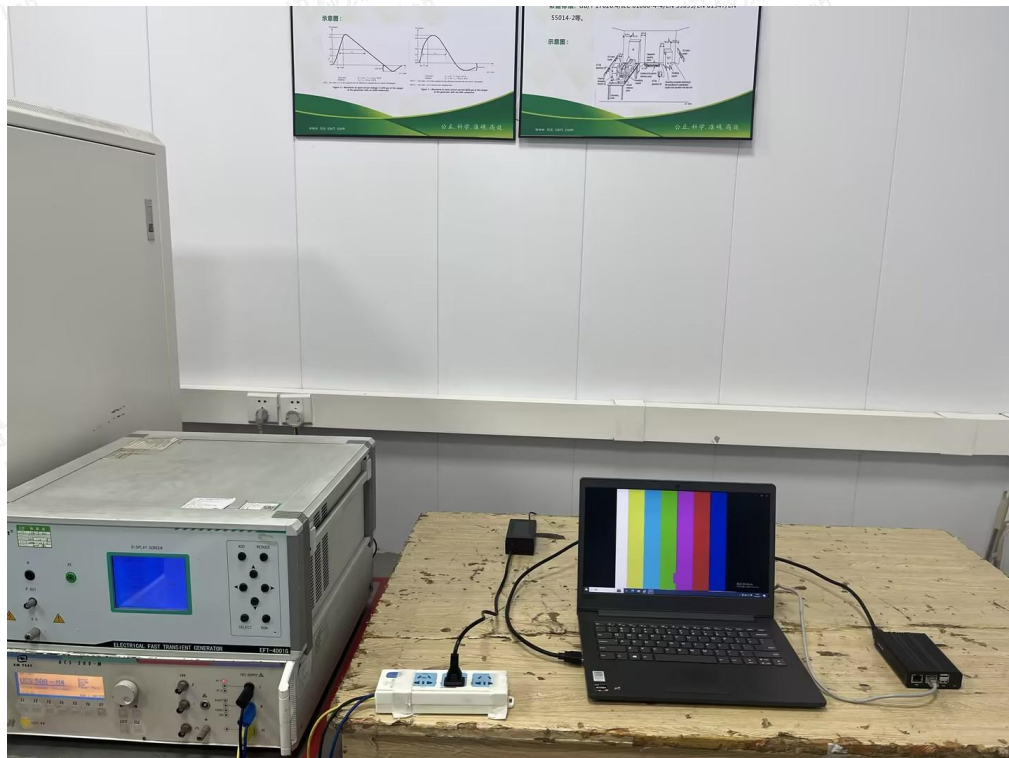
Fast Transients Common Mode