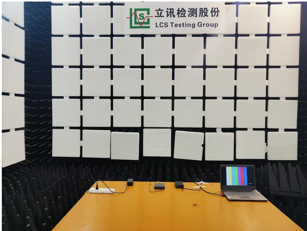
RF Electromagnetic Field (80MHz to 6 000MHz )