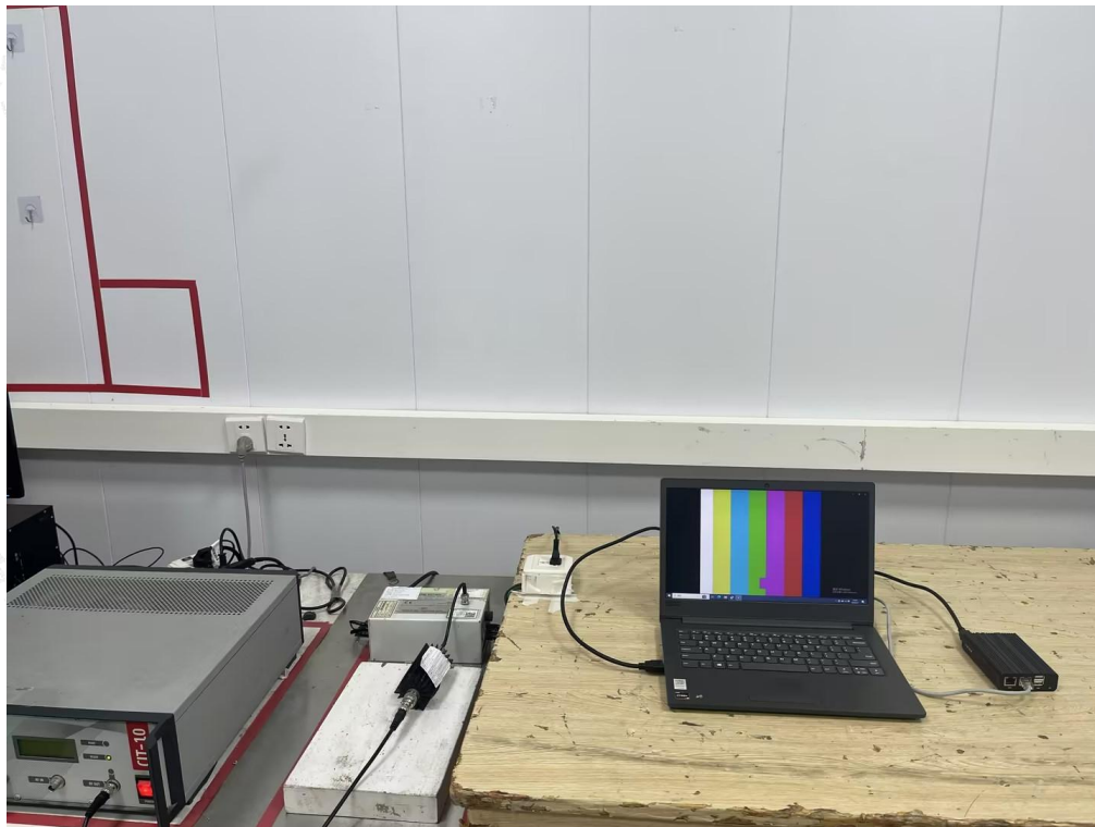
RF Common Mode (0.15 MHz to 80MHz)